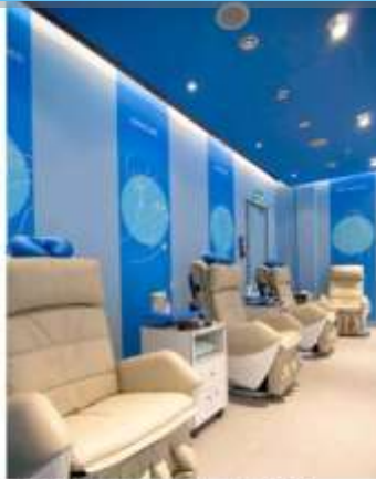
▲ Be Relax (Heathrow) airport spa specialist brand and a small cabin

The Munich location offers the same menu in 1,200m 2 (12,916sq ft), with an express jetbrush make-up service to launch into the year. The brand is opening a spa concept in Zurich in October, with locations planned for Milan, Rome, Barcelona, L1, and Birmingham, UK, in 2010.